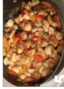
Cooking with bell peppers